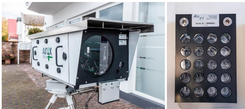
Left: Telescope unit of the Airyx Open Path system. Right: Retro reflector array.

FAST AND ACCURATE SPECTRAL TRACE GAS MEASUREMENTS USING ACTIVE SPECTROSCOPY