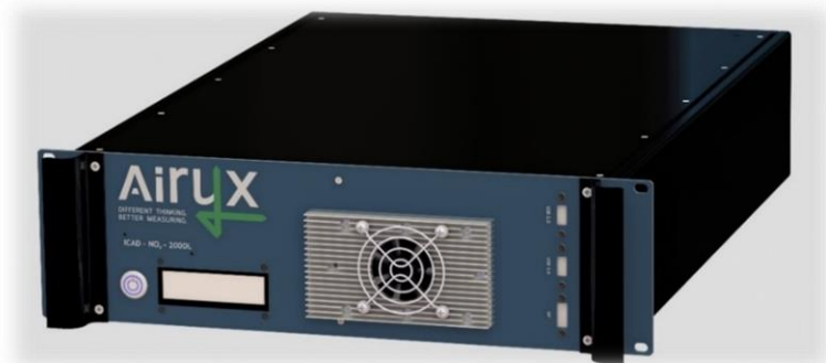
Figure 1 ICAD 200-DL series featuring 19" rack housing and OLED display.

The ICAD ( I terative C avity enhanced D OAS) NO 2 /NO x /NO measurement system uses direct optical absorption spectroscopy in the spectral range between 430 to 465 nm. In contrast to the ICAD 200 series, the "L" series features an enhanced sensitivity by using a longer absorption cell and increased reflectivity mirrors. By measuring the absorption spectrum and applying the ICAD algorithm, the unique and characteristic absorption structure of NO 2 is directly identified and separated from other overlapping absorptions like water vapour (H 2 O) or Glyoxal (C 2 H 2 O 2 ). This gives the advantage of direct NO 2 measurements (in comparison to CLD) without interferences to other substances or the need of drying mechanism which introduce new interferences (e.g., CLD, CRD, CAPS).