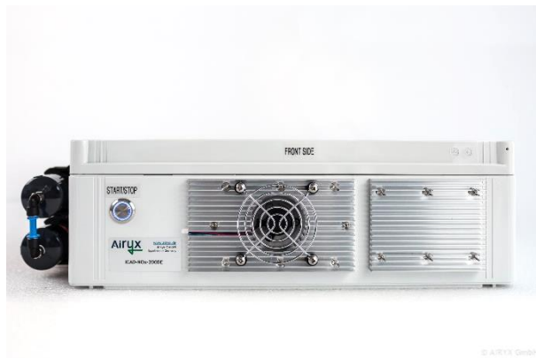
Compact, waterproof version for mobile field measurements.

The ICAD ( Iterative CA vity enhanced DOAS ) NO 2 /NO x /NO measurement system uses direct optical absorption spectroscopy in the spectral range between 430 to 465 nm. By measuring the absorption spectrum and applying the ICAD algorithm, the unique and characteristic absorption structure of NO 2 is directly identified and separated from other overlapping absorptions like water vapour (H 2 O) or Glyoxal (C 2 H 2 O 2 ). This gives the advantage of direct NO 2 measurements (in comparison to CLD) without interferences to other substances or the need of drying mechanism which introduce new interferences (e.g., CLD, CRD, CAPS).