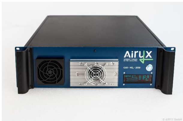
ICAD 19" rack with OLED display.

PATENTED, FAST, ACCURATE AND DIRECT NITROGEN DIOXIDE DETECTION ADDITIONAL NO x / NO MEASUREMENT WITH CONVERTER (OPTIONAL)