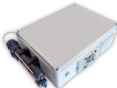
Compact, waterproof version for mobile field measurements.

The ICAD ( Iterative CA vity enhanced DOAS ) NO 2 /NO x /NO measurement system uses direct optical absorption spectroscopy in the spectral range between 430 to 465 nm. By measuring the absorption spectrum and applying the ICAD algorithm, the unique and characteristic absorption structure of NO 2 is directly identified and separated from other overlapping absorptions like water vapour (H 2 O) or Glyoxal (C 2 H 2 O 2 ). This gives the advantage of direct NO 2 measurements (in comparison to CLD) without interferences to other substances or the need of drying mechanism which introduce new interferences (e.g., CLD, CRD, CAPS).