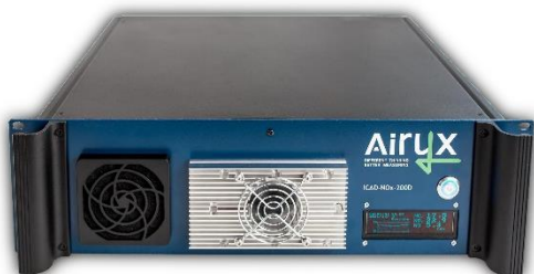
ICAD 19" rack with OLED display.

PATENTED, FAST, ACCURATE AND DIRECT NITROGEN DIOXIDE DETECTION ADDITIONAL NO x / NO MEASUREMENT WITH CONVERTER (OPTIONAL)