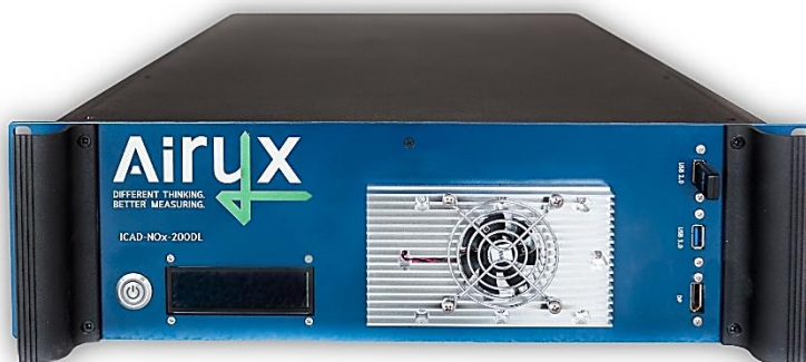
Figure 1 ICAD-NO x -200DL series featuring 19" rack housing and OLED display.

The ICAD ( Iterative CA vity enhanced DOAS ) NO 2 /NO x /NO measurement system uses direct optical absorption spectroscopy in the spectral range between 430 to 465 nm. In contrast to the ICAD 200 series, the "L" series features an enhanced sensitivity by using a longer absorption cell and increased reflectivity mirrors. By measuring the absorption spectrum and applying the ICAD algorithm, the unique and characteristic absorption structure of NO 2 is directly identified and separated from other overlapping absorptions like water vapour (H 2 O) or Glyoxal (C 2 H 2 O 2 ). This gives the advantage of direct NO 2 measurements (in comparison to CLD) without interferences to other substances or the need of drying mechanism which introduce new interferences (e.g., CLD, CRD, CAPS).