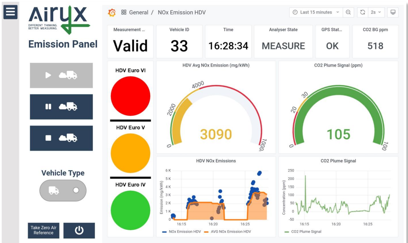
Graphical User Interface for operation and monitoring of Plume Chasing measurements.

The Plume Chasing instrument is operated by a wireless tablet and a simple graphical user interface which enables a data acquisition within a few clicks. Among other details, the user interface provides feedback about the current plume signal strength as well as the assigned emission class (EURO class) . Logfiles are created automatically and are provided for final reports of measured target vehicles.